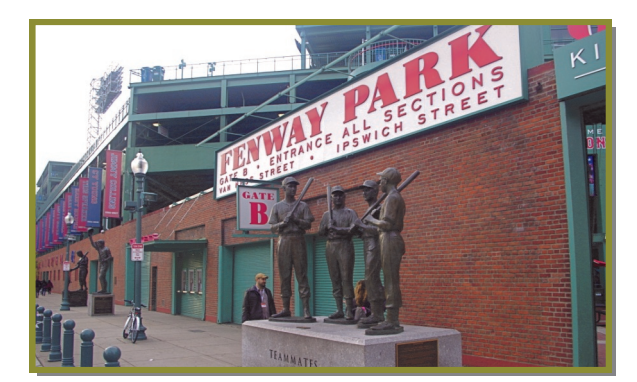
Fenway Park # 2