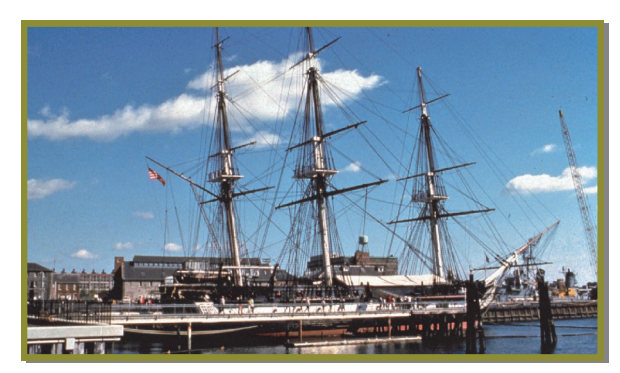
USS Constitution #3